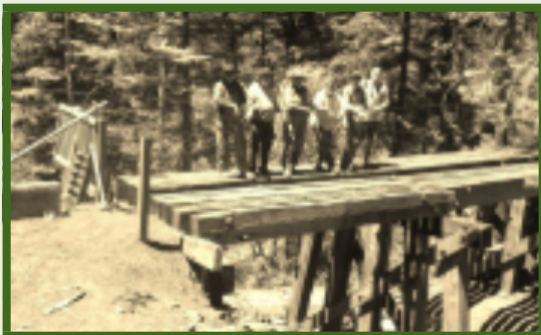
See restoration of Trestle A249, the area's newest National Historic Site

On your way to the Mexican Canyon Trestle, visit the Bonnie Brooks Property