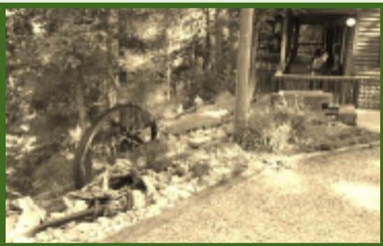
Visit a really pretty cabin built in the middle of a railroad bed